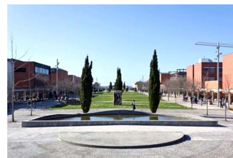
Centre for Environmental and Marine Studies (CESAM), University of Aveiro

On behalf of the Organizing Committee, we are glad to invite you to participate in the 3 rd International Conference on Food Contaminants: challenges in risk assessment (ICFC 2019) that will be held in Aveiro (Portugal) on the 26 th and 27 th of September, 2019.