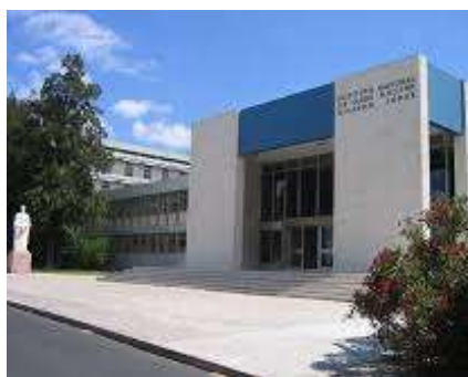
National Institute of Health Dr. Ricardo Jorge (INSA) Lisbon & Centre for Environmental and Marine Studies (CESAM), University of Aveiro